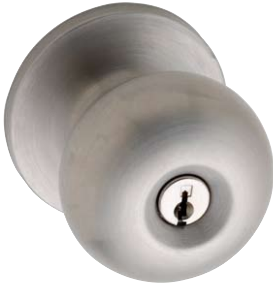
GK1000 Series Gale Style